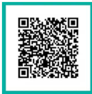
SCAN THIS FROM YOUR BANK MOBILE APP